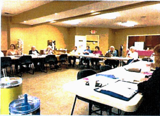
Fort Harrod Area Spring Council Meeting